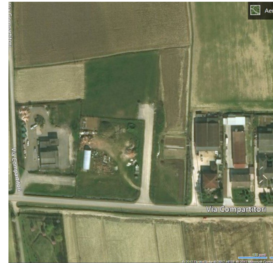
Area Mantova Banca